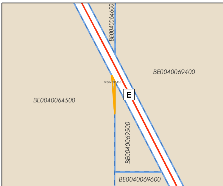
PARCEL MAP WITH LOT LINES