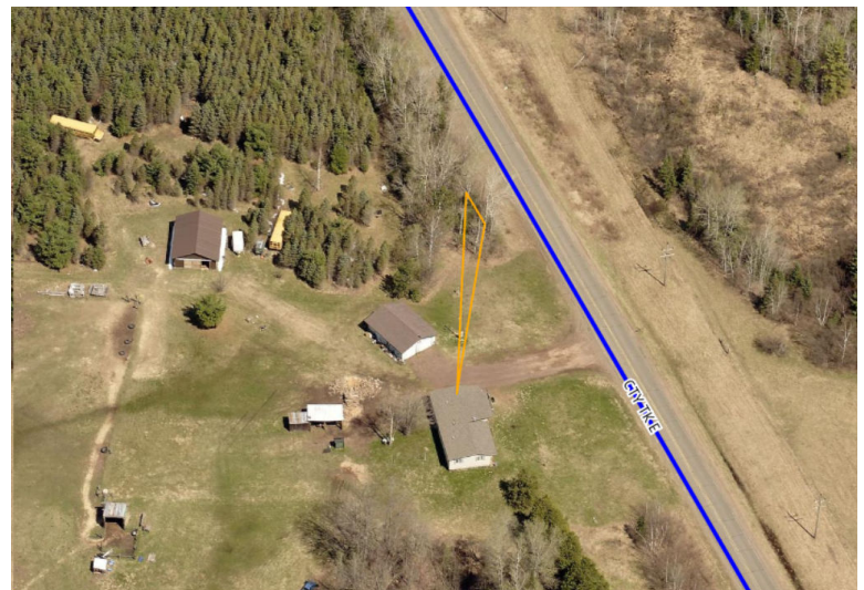
AERIAL PHOTO TAKEN SPRING 2019 NO SCALE