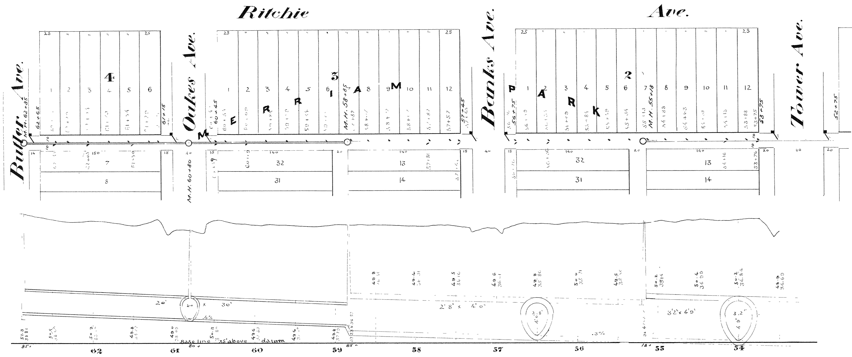
Plan & Profile of Sewer in Alley South of Ritchie Ave. Tower to Butler Ave.

Scale { Horizontal 60ft. = 1 in Vertical 6" = 1'